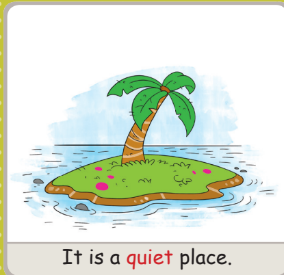
It is a quiet place.