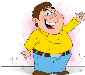
He is a pleasant boy.