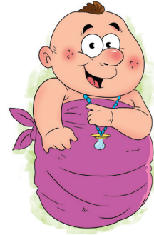
The baby is friendly .