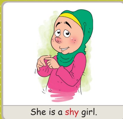
She is a shy girl.