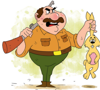
That man is cruel .