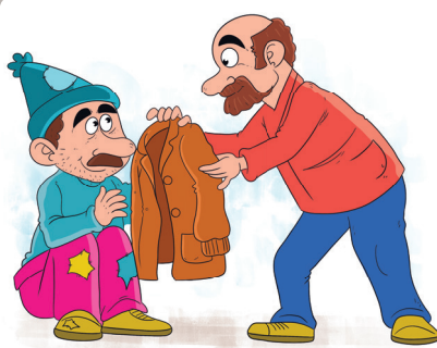
He is a generous man.