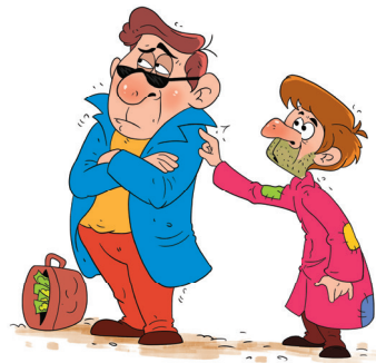
He is selfish .