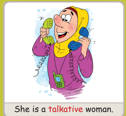
She is a talkative woman.