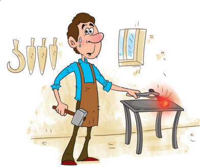
I am hard-working .