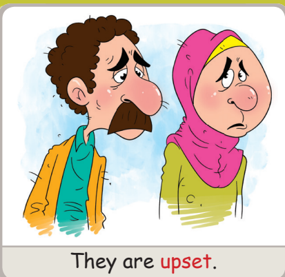
They are upset .