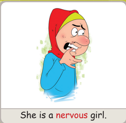
She is a nervous girl.