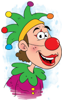
He is a funny man.