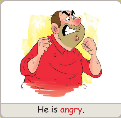
He is angry .