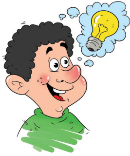
He is clever .