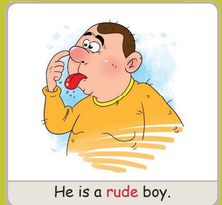
He is a rude boy.