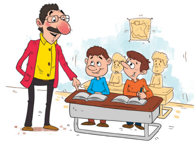
He is a kind teacher.