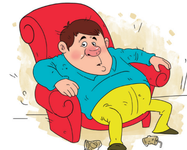
He is a lazy person.