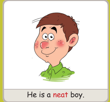
He is a neat boy.