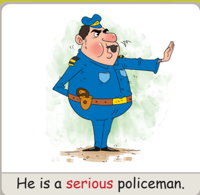
He is a serious policeman.