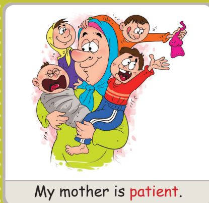
My mother is patient .