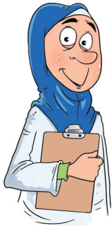
She is a helpful nurse.