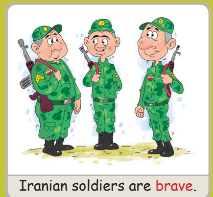
Iranian soldiers are brave .